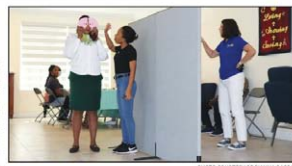
In a partnership with the Rosani Lens Project and Bahamas Rotary Clubs, four local rotaries traveled to the city of Freeport to provide vision tests and glasses to those who needed it.